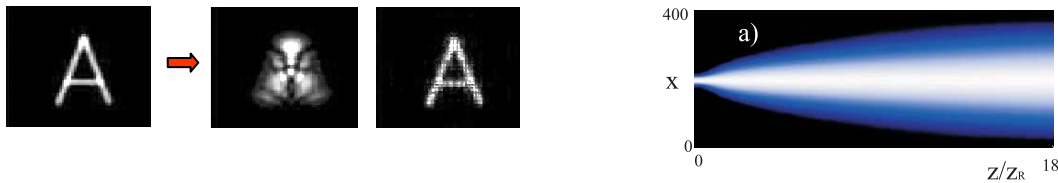
Fig 1.- (a) Letter “A” after propagation through a homogeneous medium and through a 3D photonic crystal under non-diffraction conditions. (b) Beam filtering by “superdiffusion” in a gain/loss spatially modulated crystal.

We study the linear and nonlinear propagation and dynamics of light beams in spatially modulated materials, such as photonic crystals and related structures. In particular, we study the modification of the properties of light beams which occur in the cases of: